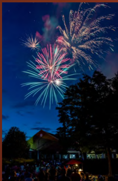
Smyrna

It is the mission of the City of Smyrna Human Resources Department to maintain a positive, productive, and progressive environment for all Human Resources employees while providing professional human resources assistance and support to all City employees, Mayor and Council, and the general public in the areas including, but not limited to, employee recruitment; benefits; classification; and compensation; payroll; training; organizational and professional development; city policies and procedures; federal, state, and local laws; risk management and employee relations in continuing efforts to attract, retain and motivate current and potential employees.