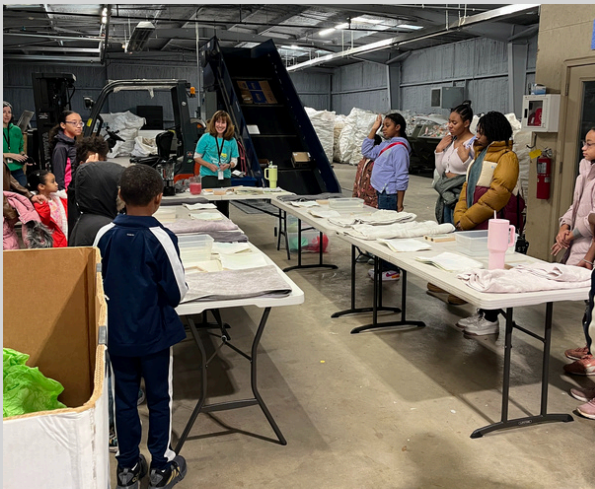
Recycling Center Tour and Education: Fourteen homeschooled students and four parents visited the Smyrna Recycling Center on Monday to tour the center and participate in a hands-on paper recycling activity. Keep Smyrna Beautiful offers tours to school groups as well as other private groups.